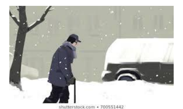
Reminder it is Flu Season

Remember it is going to get slippery so please slow down and watch for residents that may be out walking and kids crossing streets!